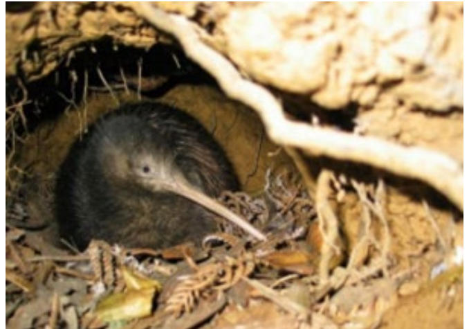
North Island brown kiwi.

The success of the operation will be measured by monitoring possums using wax tags.