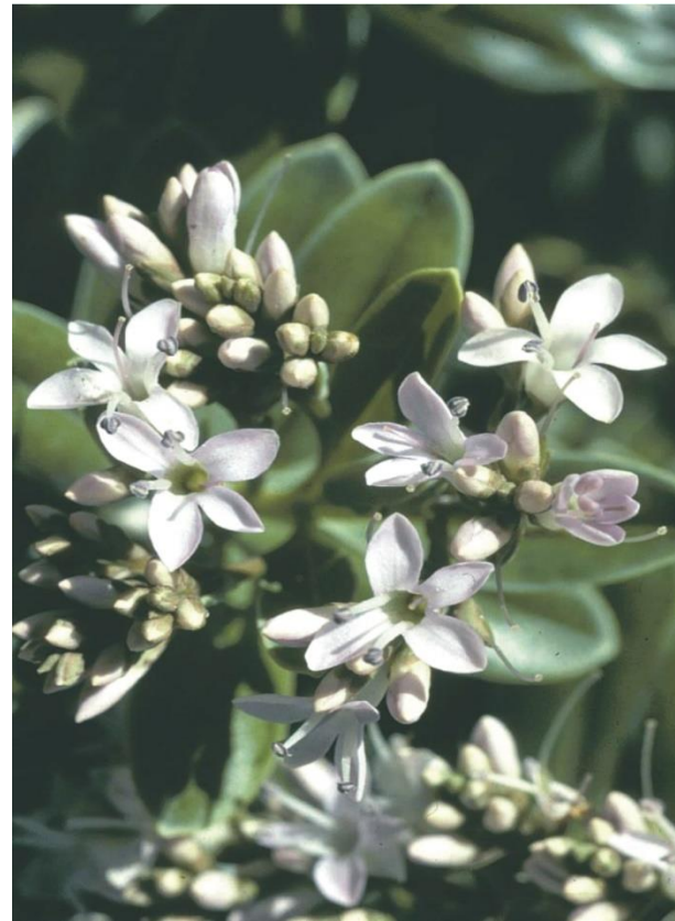
Flowering rock Hebe.

At this stage, this operation is planned to occur between the 1 st of March and 31 st April 2023. The operation is weather dependent, and you will be kept informed for specific dates.