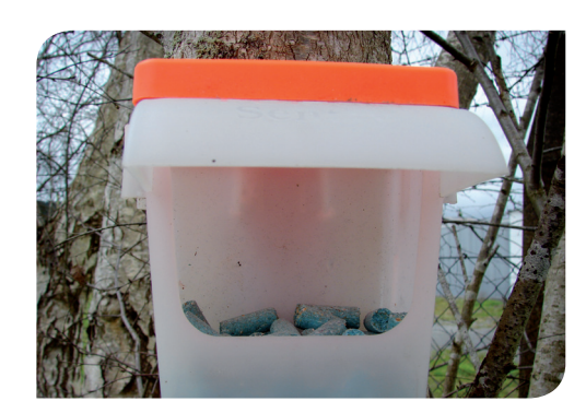
The pellets should be seen in the field only when contained in bait stations