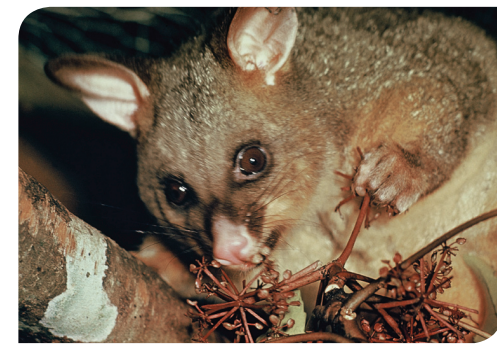
Possum eating berries: as well as damaging native flora and fauna, possums are carriers of Tb.