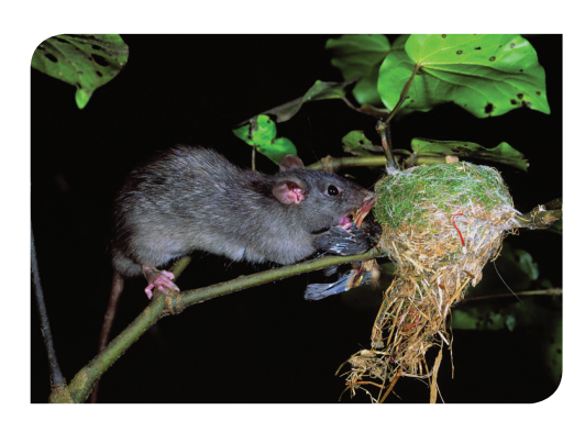
A ship's rat eats chicks taken from a fantail's nest.

Brodifacoum is particularly suited to certain situations but it needs to be used and managed with care to avoid residues, which could jeopardise meat exports (see page 8) and be a secondary poisoning hazard.