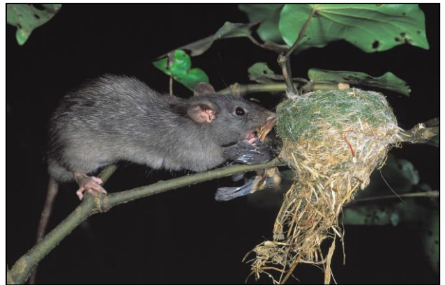
Ship rat eating fantail (piwakawaka) chicks at nest.

Use of 1080 requires the consent of the Environmental Protection Agency (EPA) and permission from the Ministry of Health. These regulations ensure that the toxin is applied safely to safeguard the public and the environment.