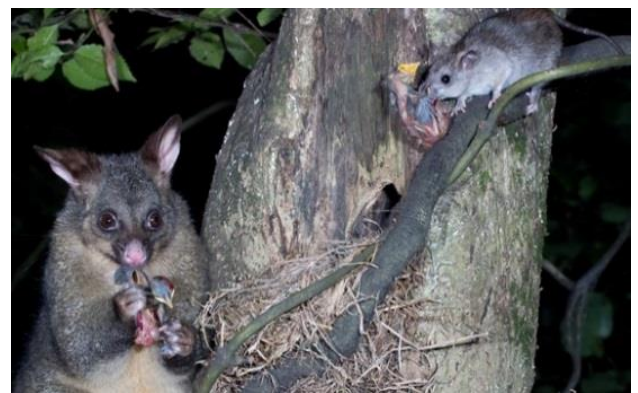
Possum and rat eating young birds.