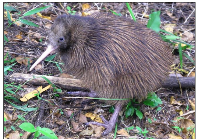
North Island brown kiwi chick.

Ongoing periodic control is required to ensure breeding success of kiwi, kokako, and other threatened taonga species.