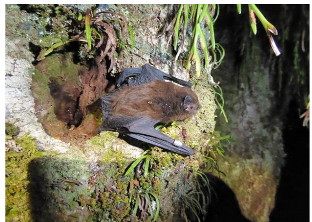
Long-tailed bat (pekapeka).